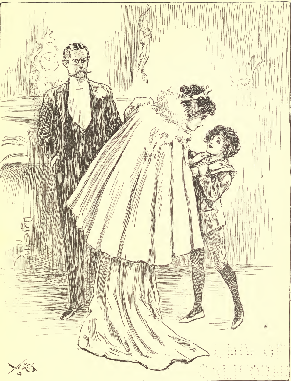
"MISS ROSE PUT HER HANDS ON HIS SHOULDERS"